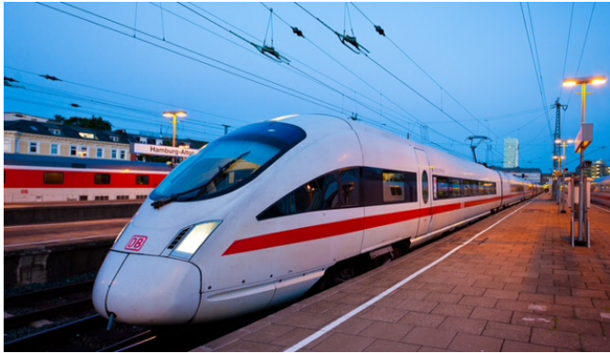
Figure 1, the ICE-T, InnerCityExpress Train, connecting 32 major cities like Frankfurt, Munich, Berlin, breakfast and a la carte and bar/bistro service at up to 300km/h - bon voyage.

So, let's have some fun and start with some train trivia. Question: What was the name of the "Chattanooga" train? How many "miles from home" was the Kingston Trio's train? How many coaches are in the train of the "Worried Man Blues"? At what time does "the train leave for Georgia"?