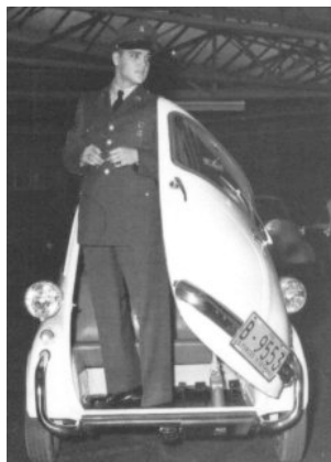
Figure 2 Elvis and the BMW

BMW, teetering on the brink of bankruptcy, when their big cars were too expensive at that time, picked up the concept. This car saved them. This Bimmer was a hot car, it was so hot that even Elvis got one, in red. He could see past