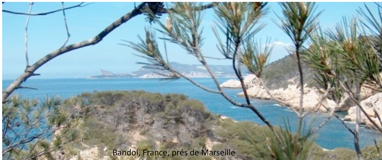
Bandol, France, près de Marseille

Heureusement pour moi, la France, n'est pas devenue 'un lointain souvenir', malgré mon départ il y a longtemps, je l'aime toujours !