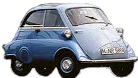
Figure 1 BMW Isetta - 1955-1962