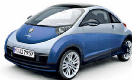
Figure 3 BMW Isetta for 2012?

Now, so many years later check this out, Fig.3, another retro car, like the VW and the Mini. This is the proposed retro BMW Isetta. I have my 1000 bucks ready!